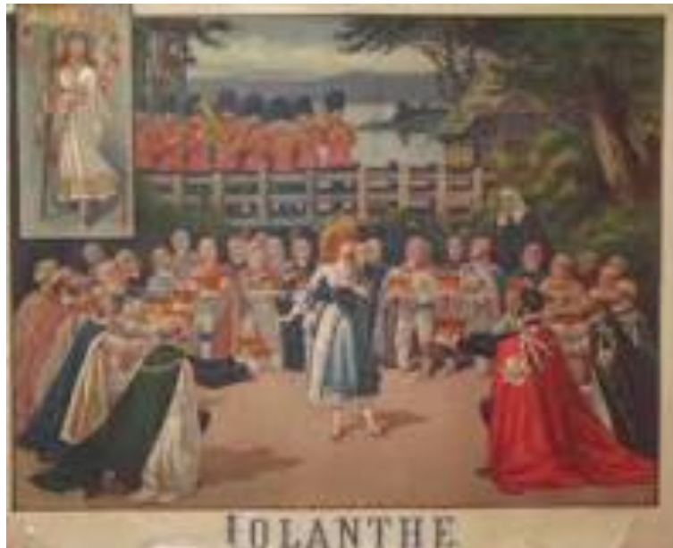
This picture is from our 1995 production of Iolanthe.

Iolanthe; or The Peer and the Peri is a comic opera with music by Arthur Sullivan and libretto by W. S. Gilbert. It is one of the Savoy operas and is the seventh collaboration of the fourteen between Gilbert and Sullivan.